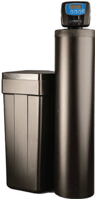
Reliant Softener with 15" x 17" Brine Tank