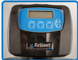
Reliant Control Valve

The Reliant is designed to be the most trouble-free water treatment system available. While many softeners are designed to be disposable, the Reliant is engineered to provide a lifetime of service.